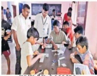
దసరా శిబిరంలో క్షేణి పాదుతుప్ప విద్యార్థులు

అమలాపతి, సెప్టెంబరు 29 (ఆంధ్రజ్యోతి) - సాంఘిక సంక్షేమ గురుకుల పాఠశాలలో దసరా సందారాలు మొదలయ్యాయి. సెలవులను సద్వినియోగం చేసుకునేలా 500 మంది విద్యార్థులతో 8 పాఠశాలల్లో శిబిరాలు నిర్వహిస్తున్నారు. ఈ శిబిరంలో విద్యార్థుల సాహజిక, క్రీడా, సాహిత్య నైపుణ్యాలను పెంచుతుండడంపై దృష్టిసారించారు. సైన్స్, ఆటల వర్క్ షాపు, స్పోర్ట్ డిభింగ్, డియట్, క్రీడేబిట్ లైటింగ్, జెండర్ డ్రైనింగ్, సోఫ్ట్ డ్రాఫ్ట్, మ్యూజిక్, యోగా, మాహీ క్రీస్మింగ్ వంటి పలు అంశాల్లో విద్యార్థులకు శిక్షణ ఇస్తున్నారు.