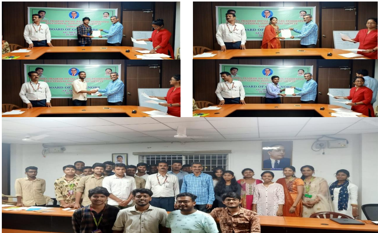
Secretary of APSWREIS appreciating the Student efforts as volunteers