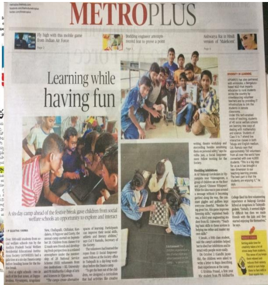
The Pre Dusseera camp event was published in reputed new papers as articles